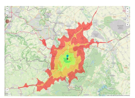
Erreichbarkeit in 20 Minuten: 422.000

Location Outskirts Industrial tax multiplier 475.00 %