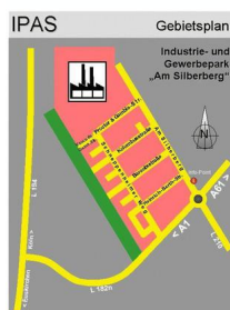
IPAS - Übersicht mit Straßennamen