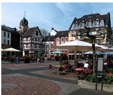
Alter Markt, Euskirchen

The `Old Town` is the main shopping area. It is centred around Market Square which is bordered by traditional buildings, cafés and restaurants. In addition to its pleasant town centre, Euskirchen is surrounded by beautiful countryside, notably the forest around the Steinbach lake. There are also many important historic houses such as Kleeburg Castle, Veynau Castle or St Martin´s Church all within a short drive from the town centre.