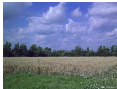
Grundstück neben GLS