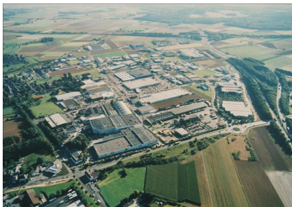
Luftbildaufnahme Gewerbegebiet Aachener Kreuz